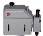
C2P Cutting- and plotting head